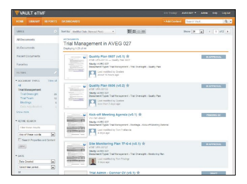
Find documents fast with dynamic filters

With an active TMF, adherence to study SOPs and regulatory requirements is not an afterthought, but an ongoing process to ensure your TMF is always inspection-ready. Vault eTMF is the only electronic trial master file that enables an active TMF operating model.