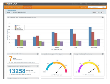
Interactive dashboards translate insights into action