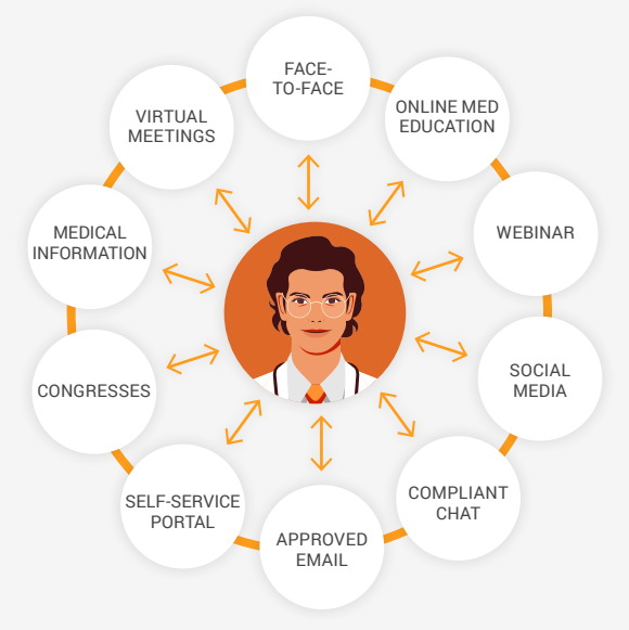
Fully integrated across channels and customized to needs and preferences