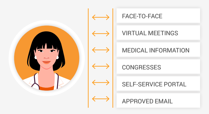
Multiple channels but not integrated